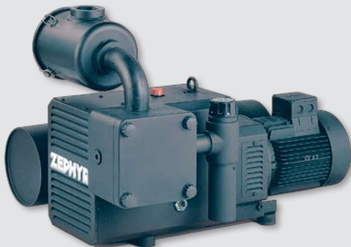
ZEPHYR VLR-251 with inlet filter and relief valve