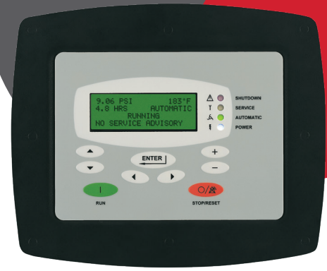
Air Smart Controller